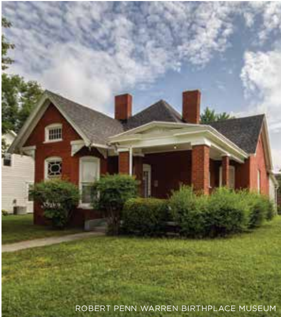
ROBERT PENN WARREN BIRTHPLACE MUSEUM